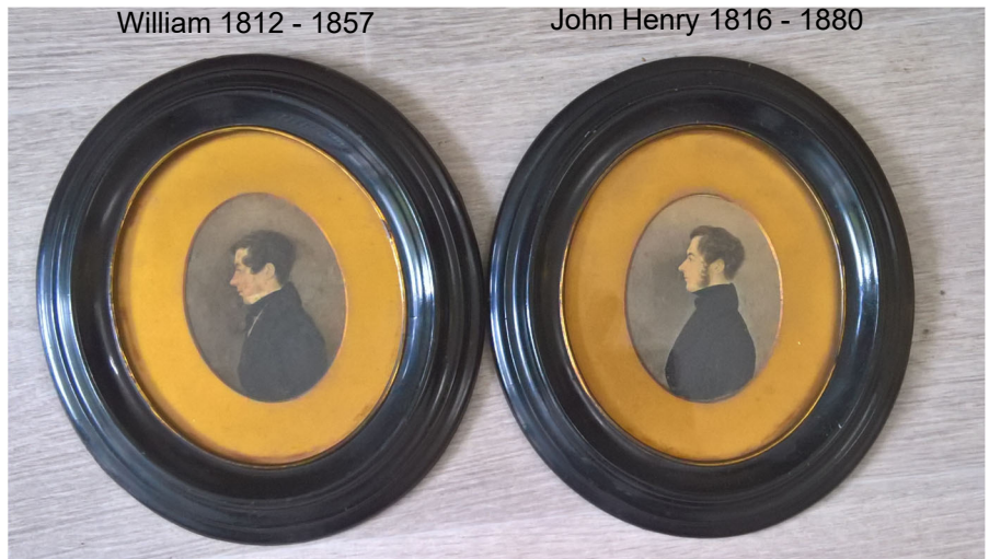
THE BLACK BOY